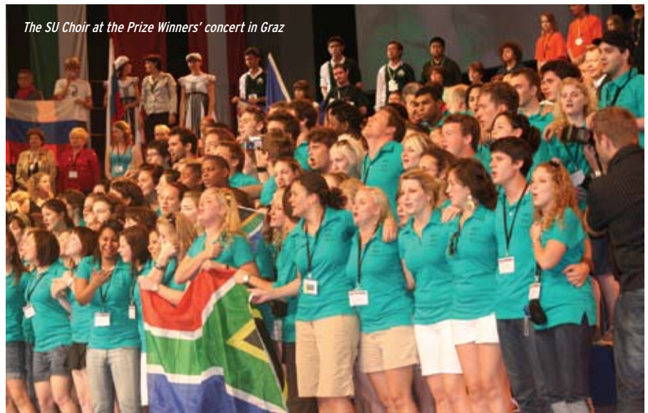
The SU Choir at the Prize Winners' concert in Graz

For breakfast the choir members each enjoyed a few of plates of food and even made a sandwich for lunch as well! Where they found room for it all will remain a students' secret. Supper was served in the messehalle (mess hall) in Graz, with all the choirs eating together in the evenings. Meals were served to almost 20 000 choir members within three hours.